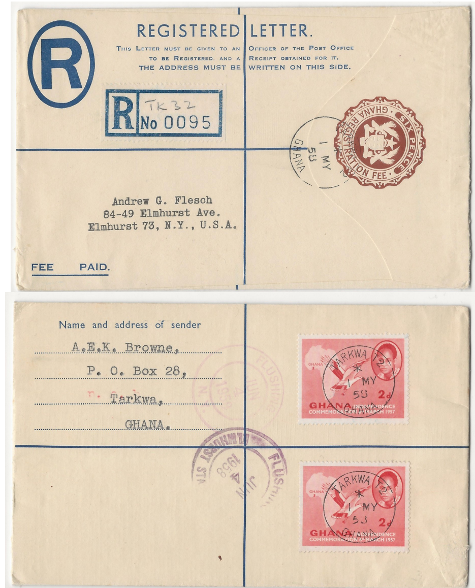
Front and reverse of registered cover